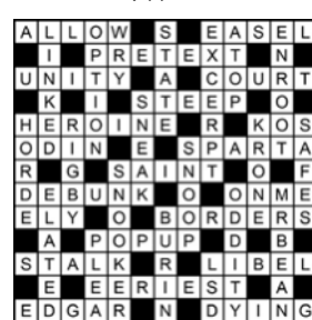
Solution to July 10