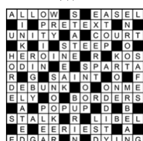
Solution to July 10