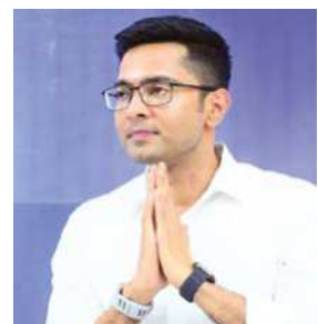
that granted him protection from coercive action.

the judicial magistrate on July 15 at noon to record his voice sample. He was directed to cooperate with the probe and comply with notices by the investigating officer as mentioned in the high court's May 21 order