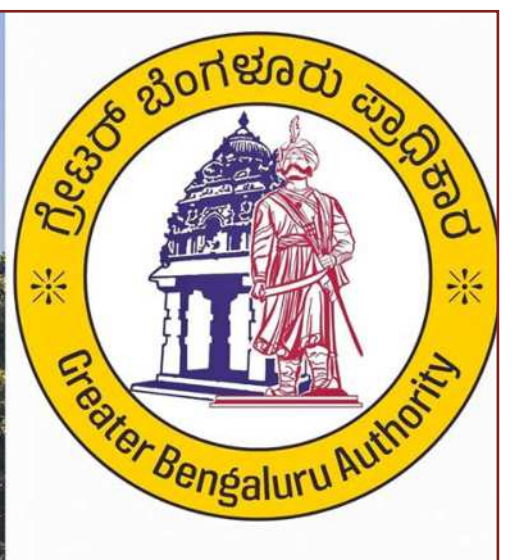
BENGALURU

THE Karnataka Government has approached the Supreme Court seeking an extension of time to conduct elections to the Greater Bengaluru Authority (GBA), citing the ongoing revision of electoral rolls and administrative challenges.