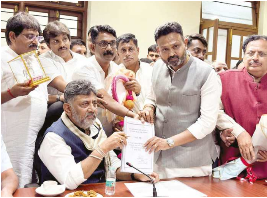
BELAGAVI