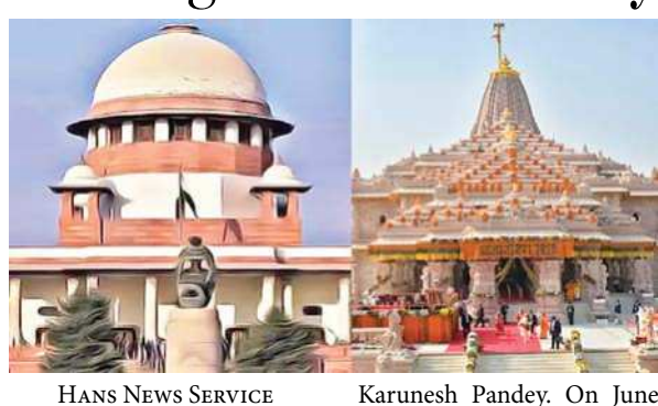
HANS NEWS SERVICE NEW DELHI