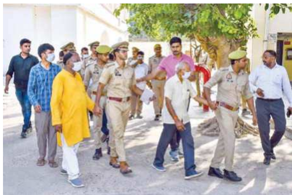
As Uttar Pradesh and Punjab head towards Assembly elections, political parties are weaponising controversies instead of addressing governance. Whether it is "Chanda Chori" or the Satluj debate, accountability has become selective while controversies are amplified and pressing concerns of ordinary citizens are sidelined.

Similarly, the alleged theft of donation money at the Ram Janmabhoomi temple in Ayodhya offers another example of how India's political class has