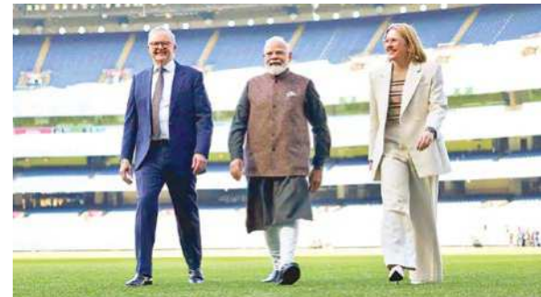
Prime Minister Narendra Modi with his Australian counterpart Anthony Albanese at the MCG