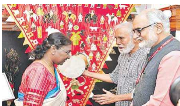
The significance of Adya Kala has been recognized nationally. Artifacts from its collection have been displayed at prestigious venues, including the Salar Jung Museum in Hyderabad and Rashtrapati Bhavan in New Delhi. "Janjatiya Darpan", a gallery developed by IGNCA, celebrates the shared cultural traditions of India's tribal communities. The inclusion of artifacts from Adya Kala highlights the national importance of Telangana's indigenous heritage. Adya Kala is not merely a museum; it is a cultural movement dedicated to preserving the voices, memories, and artistic traditions of tribal communities.

These instruments are more than musical tools; they represent centuries of indigenous knowledge, artistic skill, and cultural identity. Crafted from