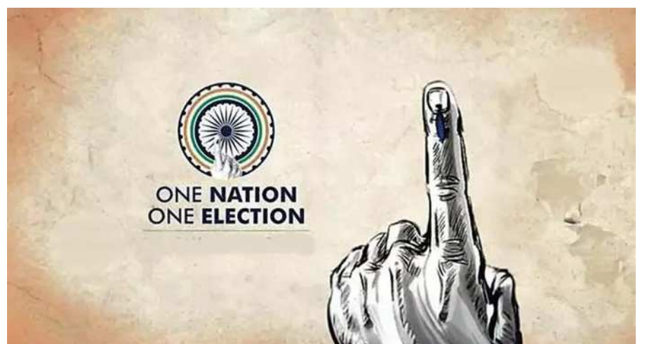
and various organisations, favour simultaneous elections. The effort now is to evolve a mechanism that is acceptable to all political parties," he said.