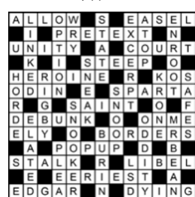
Solution to July 10