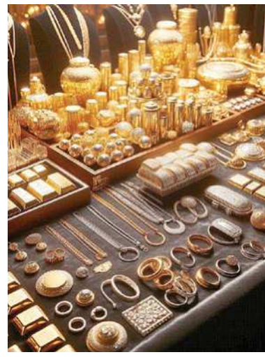
"Gold prices traded modestly higher on Friday as a weak US dollar and bargain buying supported sentiment after

Traders said the recovery came as the dollar index weakened for the third straight session, boosting the appeal of precious metals, while investors also took advantage of lower prices after gold touched a one-week low earlier this week.