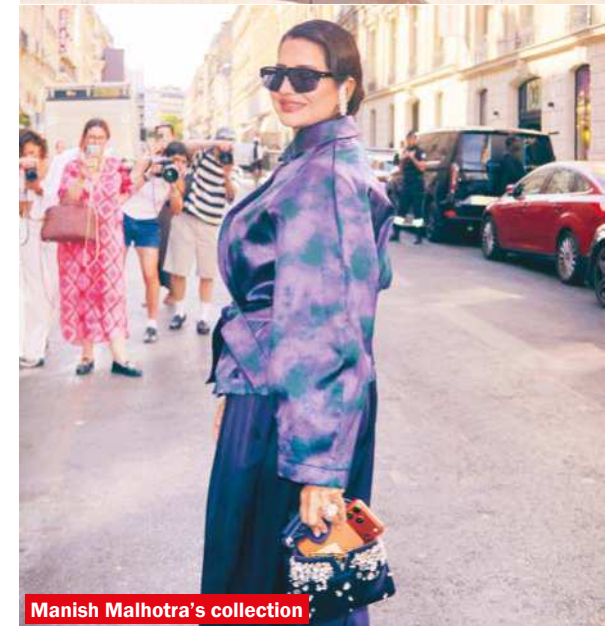
Manish Malhotra's collection

At Giorgio Armani Privé, she wore Look 74 — an iridescent blue jacket with hints of violet and forest green, fitted at the waist in classic Armani style. A crystal-covered Louis Vuitton Capucines bag added shine, but her jewellery stood out most: a 30-carat panther-motif ear piece set fully in diamonds, along with the 23-carat yellow diamond ring and 30-carat rose-cut polki ring she’d worn to the Met Gala. The next day was Elie Saab’s Citrus & Salt collection, and a completely different mood — a strapless gown in citrus tones with delicate floral embroidery. A custom turquoise Elie Saab ear cuff, a rare gesture from the house, and a seashell-shaped Cult Gaia clutch rounded out the look, alongside a 21-carat pigeon-blood ruby ring and a 25-carat emerald ring. Her last stop was Manish Malhotra’s Indian couture debut in Paris. A structured corseted gown with a cropped chocolate-brown jacket, sharp puff sleeves and hand-embroidered 3D floral detailing gave the outfit real weight and texture. Here she wore the standout piece of the week: a custom