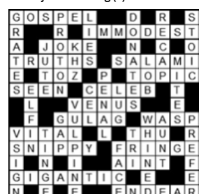
Solution to July 9