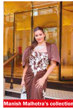
Manish Malhotra's collection