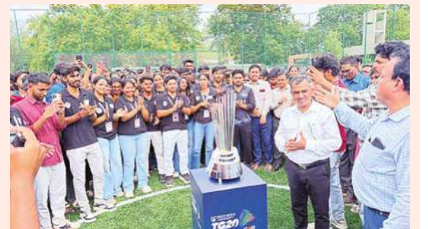
recognise student achievements and reaffirm its vision of developing globally competent graduates.

The celebrations will culminate on July 10 with Founder's Day, when the university will formally