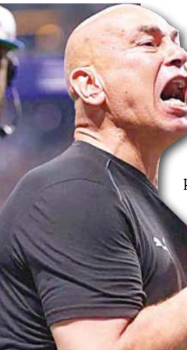
Egypt head coach Hossam Hassan was furious after Egypt's loss against Argentina

ATLANTA: The Egyptian Football Association (EFA) said Wednesday it "cannot remain silent" after what it believes was unfair and biased officiating in Egypt's 3-2 round of 16 loss against Argentina.