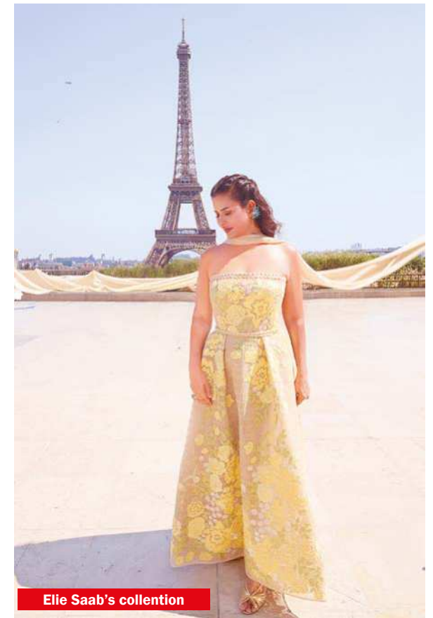
Elie Saab's collection

At Giorgio Armani Privé, she wore Look 74 — an iridescent blue jacket with hints of violet and forest green, fitted at the waist in classic Armani style. A crystal-covered Louis Vuitton Capucines bag added shine, but her jewellery stood out most: a 30-carat panther-motif ear piece set fully in diamonds, along with the 23-carat yellow diamond ring and 30-carat rose-cut polki ring she'd worn to the Met Gala. The next day was Elie Saab's Citrus & Salt collection, and a completely different mood — a strapless gown in citrus tones with delicate floral embroidery. A custom turquoise Elie Saab ear cuff, a rare gesture from the house, and a seashell-shaped Cult Gaia clutch rounded out the look, alongside a 21-carat pigeon-blood ruby ring and a 25-carat emerald ring. Her last stop was Manish Malhotra's Indian couture debut in Paris. A structured corseted gown with a cropped chocolate-brown jacket, sharp puff sleeves and hand-embroidered 3D floral detailing gave the outfit real weight and texture. Here she wore the standout piece of the week: a custom