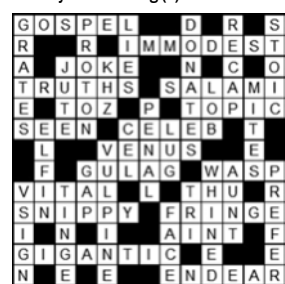
Solution to July 9