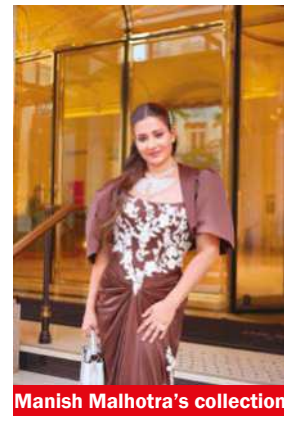
Manish Malhotra's collection

Three days, three couture houses, one very full jewellery box. The Hyderabad-based billionaire and philanthropist returned to Paris Haute Couture Week for the first time since 2022, following her much-talked-about Met Gala look earlier this year, with an estimated $30 million in personal jewellery across her front-row appearances.