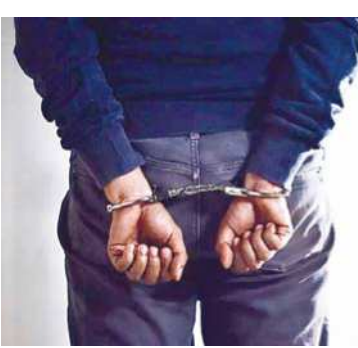
"On June 15, the businessman, a resident of Mukherjee Nagar,