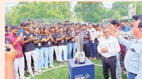
recognise student achievements and reaffirm its vision of developing globally competent graduates.

The celebrations will culminate on July 10 with Founder's Day, when the university will formally