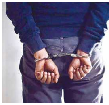
"On June 15, the businessman, a resident of Mukherjee Nagar,