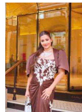
Manish Malhotra's collection

Three days, three couture houses, one very full jewellery box. The Hyderabad-based billionaire and philanthropist returned to Paris Haute Couture Week for the first time since 2022, following her much-talked-about Met Gala look earlier this year, with an estimated $30 million in personal jewellery across her front-row appearances.