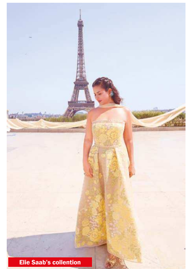
Elie Saab's collection

At Giorgio Armani Privé, she wore Look 74 — an iridescent blue jacket with hints of violet and forest green, fitted at the waist in classic Armani style. A crystal-covered Louis Vuitton Capucines bag added shine, but her jewellery stood out most: a 30-carat panther-motif ear piece set fully in diamonds, along with the 23-carat yellow diamond ring and 30-carat rose-cut polki ring she'd worn to the Met Gala. The next day was Elie Saab's Citrus & Salt collection, and a completely different mood — a strapless gown in citrus tones with delicate floral embroidery. A custom turquoise Elie Saab ear cuff, a rare gesture from the house, and a seashell-shaped Cult Gaia clutch rounded out the look, alongside a 21-carat pigeon-blood ruby ring and a 25-carat emerald ring. Her last stop was Manish Malhotra's Indian couture debut in Paris. A structured corseted gown with a cropped chocolate-brown jacket, sharp puff sleeves and hand-embroidered 3D floral detailing gave the outfit real weight and texture. Here she wore the standout piece of the week: a custom