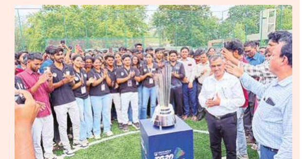
recognise student achievements and reaffirm its vision of developing globally competent graduates.

The celebrations will culminate on July 10 with Founder's Day, when the university will formally