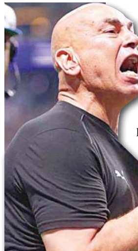
Egypt head coach Hossam Hassan was furious after Egypt's loss against Argentina

ATLANTA: The Egyptian Football Association (EFA) said Wednesday it "cannot remain silent" after what it believes was unfair and biased officiating in Egypt's 3-2 round of 16 loss against Argentina.