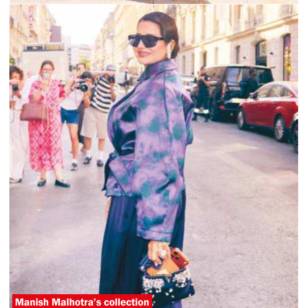
Manish Malhotra's collection

At Giorgio Armani Privé, she wore Look 74 — an iridescent blue jacket with hints of violet and forest green, fitted at the waist in classic Armani style. A crystal-covered Louis Vuitton Capucines bag added shine, but her jewellery stood out most: a 30-carat panther-motif ear piece set fully in diamonds, along with the 23-carat yellow diamond ring and 30-carat rose-cut polki ring she'd worn to the Met Gala. The next day was Elie Saab's Citrus & Salt collection, and a completely different mood — a strapless gown in citrus tones with delicate floral embroidery. A custom turquoise Elie Saab ear cuff, a rare gesture from the house, and a seashell-shaped Cult Gaia clutch rounded out the look, alongside a 21-carat pigeon-blood ruby ring and a 25-carat emerald ring. Her last stop was Manish Malhotra's Indian couture debut in Paris. A structured corseted gown with a cropped chocolate-brown jacket, sharp puff sleeves and hand-embroidered 3D floral detailing gave the outfit real weight and texture. Here she wore the standout piece of the week: a custom