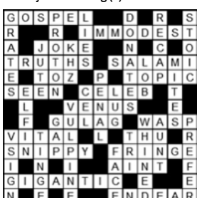
Solution to July 9