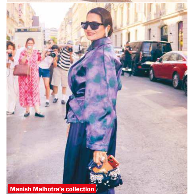
Manish Malhotra's collection

75-carat diamond bow necklace inspired by Persian design, paired with a floral diamond hair piece, a 25-carat square-cut diamond ring and a 21-carat round-cut diamond ring. Three houses, three very different looks — Armani's