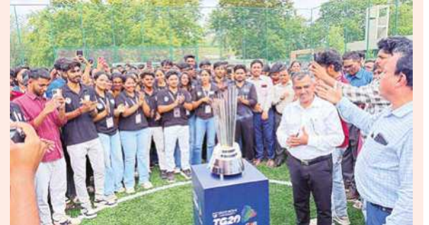
recognise student achievements and reaffirm its vision of developing globally competent graduates.

The celebrations will culminate on July 10 with Founder's Day, when the university will formally