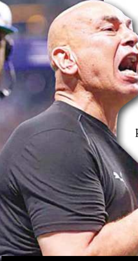
Egypt head coach Hossam Hassan was furious after Egypt's loss against Argentina

ATLANTA: The Egyptian Football Association (EFA) said Wednesday it "cannot remain silent" after what it believes was unfair and biased officiating in Egypt's 3-2 round of 16 loss against Argentina.