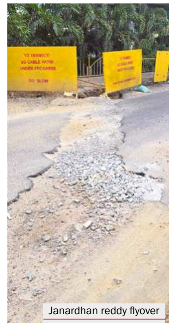
Janardhan Reddy flyover