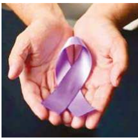
Today is Chronic Disease Awareness Day