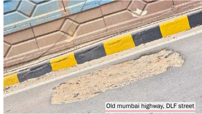
Old Mumbai highway, DLF street

Satyam assured the issue of allotting pattas to every eligible family in Gundla Singaram would be taken to the CM's notice and raised in the council. He advised the poor to continue struggle until they secure their rightful pattas.