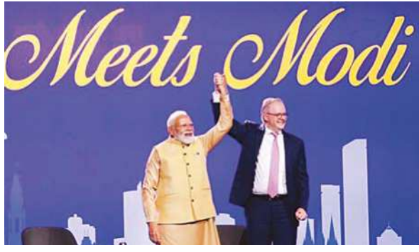
PM Narendra Modi with Australian Prime Minister Anthony Albanese during a community event, in Melbourne on Thursday

MELBOURNE INDIA, driven by the vision of "Grow More, Achieve More", is working towards the goal of becoming a developed nation, Prime Minister Narendra Modi said on Thursday, underscoring that the foundation of the country's big dreams and great aspirations is its people. Speaking at an Indian diaspora event, 'Melbourne meets Modi', also attended by Australian Prime Minister Anthony Albanese, PM Modi said he was delighted that the partnership between the two countries in the areas of education, skills and innovation is deepening and strengthening. "India of the 21st century is working towards the goal of becoming a developed nation. When one dream is realised, a new one is born. This is an India that believes in 'Grow More, Achieve More'," Modi said, amid cheers from the audience.