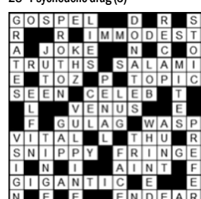
Solution to July 9