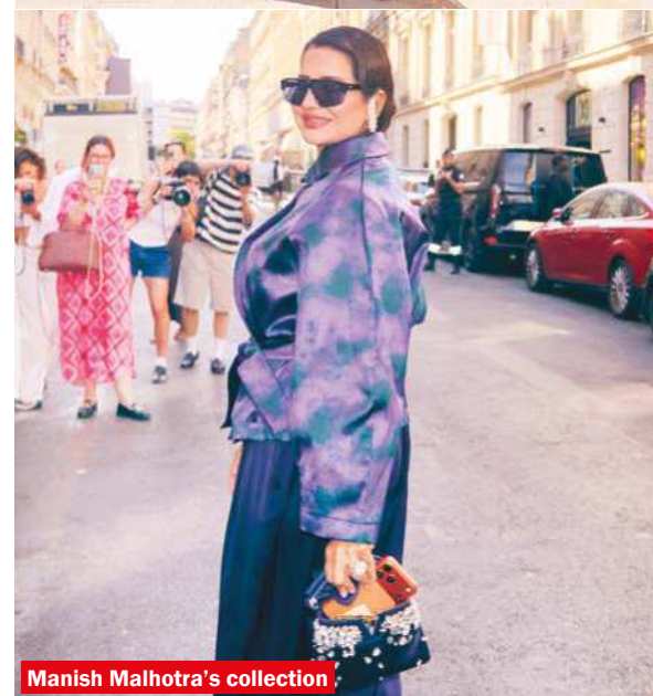
Manish Malhotra’s collection

At Giorgio Armani Privé, she wore Look 74 — an iridescent blue jacket with hints of violet and forest green, fitted at the waist in classic Armani style. A crystal-covered Louis Vuitton Capucines bag added shine, but her jewellery stood out most: a 30-carat panther-motif ear piece set fully in diamonds, along with the 23-carat yellow diamond ring and 30-carat rose-cut polki ring she’d worn to the Met Gala. The next day was Elie Saab’s Citrus & Salt collection, and a completely different mood — a strapless gown in citrus tones with delicate floral embroidery. A custom turquoise Elie Saab ear cuff, a rare gesture from the house, and a seashell-shaped Cult Gaia clutch rounded out the look, alongside a 21-carat pigeon-blood ruby ring and a 25-carat emerald ring. Her last stop was Manish Malhotra’s Indian couture debut in Paris. A structured corseted gown with a cropped chocolate-brown jacket, sharp puff sleeves and hand-embroidered 3D floral detailing gave the outfit real weight and texture. Here she wore the standout piece of the week: a custom