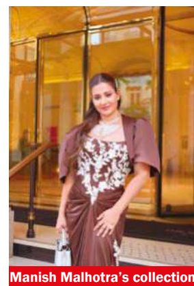
Manish Malhotra’s collection