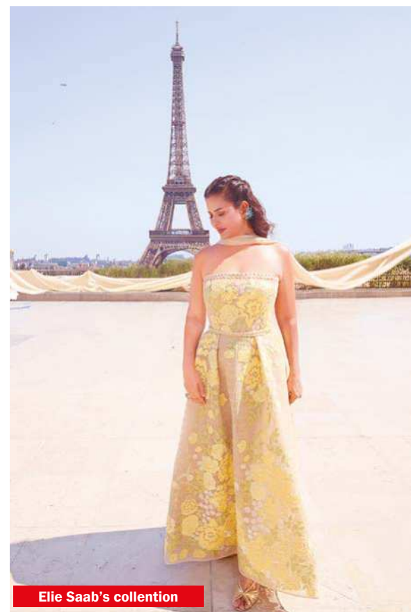
Elie Saab’s collection

Three days, three couture houses, one very full jewellery box. The Hyderabad-based billionaire and philanthropist returned to Paris Haute Couture Week for the first time since 2022, following her much-talked-about Met Gala look earlier this year, with an estimated $30 million in personal jewellery across her front-row appearances.