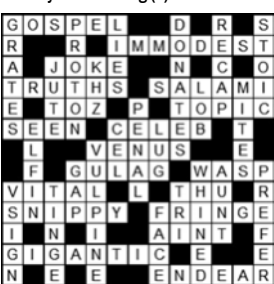
Solution to July 9