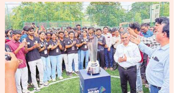
recognise student achievements and reaffirm its vision of developing globally competent graduates.

The celebrations will culminate on July 10 with Founder's Day, when the university will formally