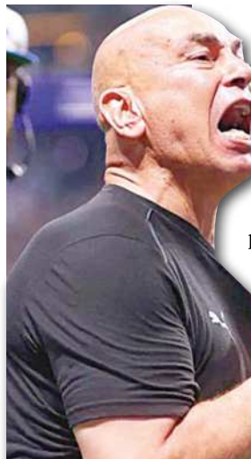
Egypt head coach Hossam Hassan was furious after Egypt's loss against Argentina

ATLANTA: The Egyptian Football Association (EFA) said Wednesday it "cannot remain silent" after what it believes was unfair and biased officiating in Egypt's 3-2 round of 16 loss against Argentina.