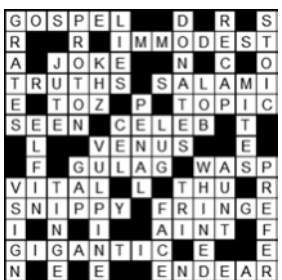
Solution to July 9