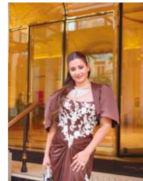
Manish Malhotra’s collection

Three days, three couture houses, one very full jewellery box. The Hyderabad-based billionaire and philanthropist returned to Paris Haute Couture Week for the first time since 2022, following her much-talked-about Met Gala look earlier this year, with an estimated $30 million in personal jewellery across her front-row appearances.