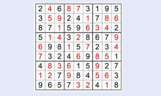
Solution to July 9