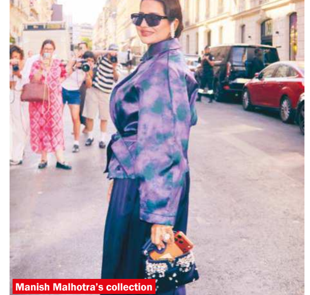
Manish Malhotra’s collection

75-carat diamond bow necklace inspired by Persian design, paired with a floral diamond hair piece, a 25-carat square-cut diamond ring and a 21-carat round-cut diamond ring. Three houses, three very different looks — Armani’s