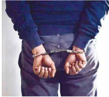
"On June 15, the businessman, a resident of Mukherjee Nagar,