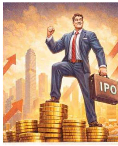
Offer-for-Sale (OFS) of Rs 200 crore by promoters.

The IPO comprises a fresh issue of equity shares worth Rs 542 crore and an