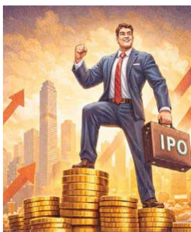
Offer-for-Sale (OFS) of Rs 200 crore by promoters.

The IPO comprises a fresh issue of equity shares worth Rs 542 crore and an