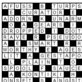
Solution to June 17