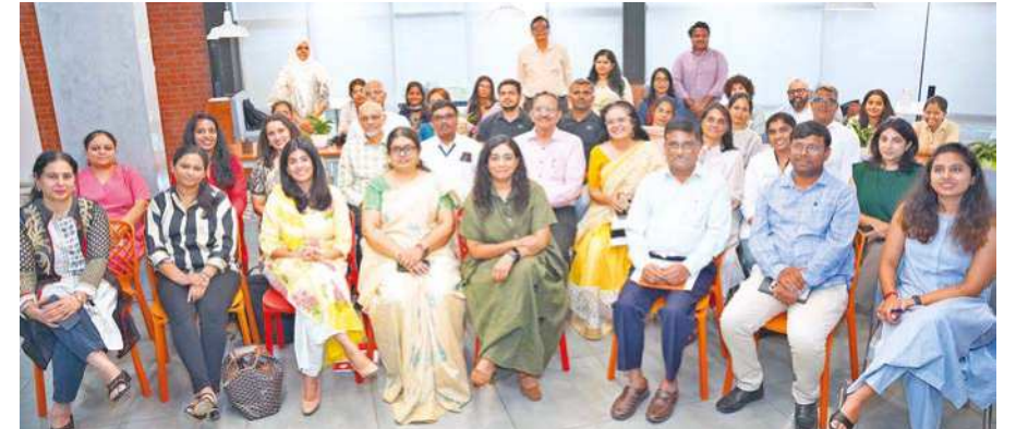
Women led startups at India's first SHELterTech Accelerator organised by We Hub

Dates: 19th and 20th June 2026. Venue: MSU Store, Jubilee Hills, Hyderabad.