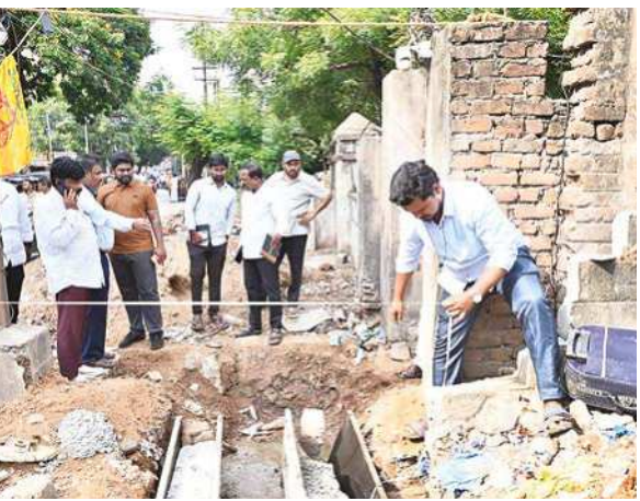
Municipal Commissioner YO Nandan inspecting drainage canal works in Nellore on Wednesday