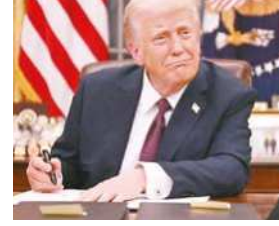
Trump clarified that only a memorandum of understanding was in the works, and that no deal had been finalised. "If I don't like it, we will go back to shooting at them," Trump said, adding: "If they don't behave, we'll go right back to dropping bombs right smack in the middle of their head." He made the remarks sitting alongside Egyptian President Abdel Fattah el-Sisi. Continued on Page 7

EVIAN-LES-BAINS JUST as things were looking up for the peace efforts in the Middle East, US President Donald Trump on Wednesday crushed hopes again, with fresh warnings to Iran. During his remarks at the G7 Summit in France, Trump said that no deal had been finalised with Iran and warned he would resume "dropping bombs" and go back to shooting if Tehran did not abide by its obligations. Trump clarified that only a memorandum of understanding was in the works, and that no deal had been finalised. "If I don't like it, we will go back to shooting at them," Trump said, adding: "If they don't behave, we'll go right back to dropping bombs right smack in the middle of their head." He made the remarks sitting alongside Egyptian President Abdel Fattah el-Sisi. Continued on Page 7