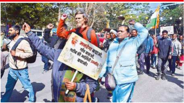
According to an analysis by the activists, no major state would be able to generate even half of the promised 125 days of employment per active job card in the proposed interim allocations

They further alleged that the proposed framework centralises powers with the Centre while reducing