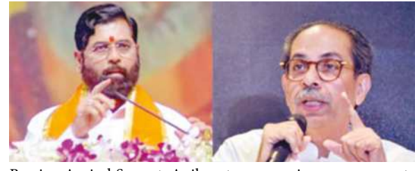
Barring Arvind Sawant, Anil Desai and Rajabhau Waze, all the remaining MPs are understood to have joined the new group. Sena (UBT) MPs Sanjay Raut, Sawant and Desai also met Birla and urged him not to recognise any separate group formed by defecting Sena (UBT) MPs. However, Sena functionaries claimed that Birla had recognised the group of six MPs as a separate bloc. Continued on Page 7

MUMBAI SIX Shiv Sena (UBT) MPs reportedly formed a separate group in the Lok Sabha on Wednesday and submitted a letter to Lok Sabha Speaker Om Birla. The six MPs are expected to join the Eknath Shinde-led Shiv Sena on Friday, the party's foundation day. Sena functionaries said the process of forming the separate group was completed smoothly. The Shiv Sena (UBT) has nine MPs in the Lok Sabha. Barring Arvind Sawant, Anil Desai and Rajabhau Waze, all the remaining MPs are understood to have joined the new group. Sena (UBT) MPs Sanjay Raut, Sawant and Desai also met Birla and urged him not