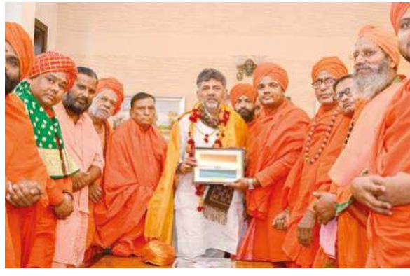
the seer had raised concerns regarding alleged injustice meted out to the Ediga and other backward commu-