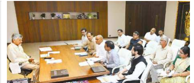
Chief Minister N Chandrababu Naidu reviews agriculture, horticulture and aquaculture sectors at the Secretariat in Amaravati on Wednesday

EVIAN-LES-BAINS: US President Donald Trump on Wednesday showered praise on Prime Minister Narendra Modi in France's Evian on the sidelines of the G7 Summit 2026. Assigning adjectives like "a killer and a tough trader" to PM Modi, Trump said he has immense respect for the leader. "He's a very tough negotiator... You look at this man. I'll give you a lesson. He's the most beautiful-looking man. He looks so nice, like an angel. But actually, he's as tough as a killer... But he looks so good. So he gets you by surprise. There are a few people like this," Trump said as the two leaders held a bilateral meeting in France. Continued on Page 7