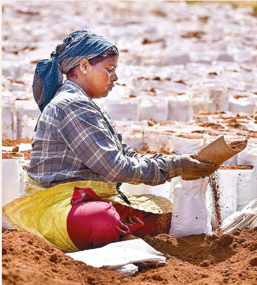
A woman worker fills soil into plastic grow bags for raising saplings at a nursery in Chikkamagaluru district on Wednesday