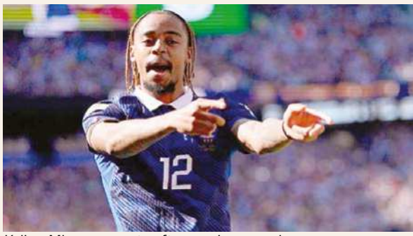
Kylian Mbappe reacts after scoring a goal