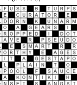
Solution to June 17