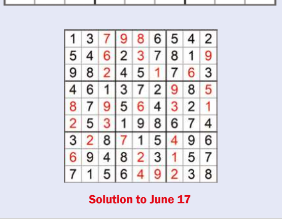
Solution to June 17