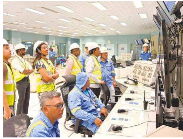
Members of AP municipal administration and urban development department delegation at Tuas South Incineration Plant in Singapore on Wednesday

At NUS Cities, officials explored opportunities for collaboration in urban planning, climate resilience, gov-