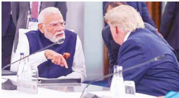
US President Donald Trump with PM Narendra Modi on the sidelines of the G7 summit in Evian-les-Bains, France, on Wednesday

"Lakhs of Indian seafarers operate in maritime sector; I believe that their security is equally important," PM Modi told President Trump. India lost 3 Indian seafarers in an