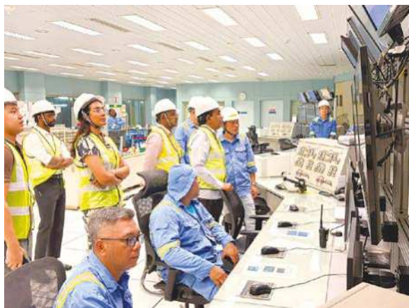
Members of AP municipal administration and urban development department delegation at Tuas South Incineration Plant in Singapore on Wednesday

At NUS Cities, officials explored opportunities for collaboration in urban planning, climate resilience, gov-