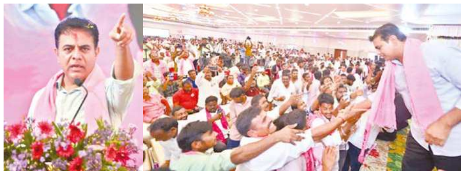
BRS working president MLA KT Rama Rao interacting with party leaders and workers during the meeting at Palair in Khammam district on Wednesday

To mark the successful implementation of the scheme, a national-level event will be held at Vigyan Bhawan, New Delhi, on Friday, in the presence of the Prime Minister. Benefits worth approximately Rs 2,400 crore will be disbursed to eligible beneficiaries. In the erstwhile Krishna district, a regional event will be organised at VR Siddhartha Engineering College, Kanuru, with participation from public representatives, industry leaders, employers, employees and EPFO officials.