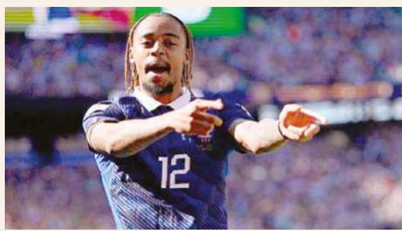
Kylian Mbappe reacts after scoring a goal

Having equalled Klose's record, Messi will have the chance to claim it outright when Argentina face Austria on June 22. Algeria, meanwhile, take on Jordan in their next Group J outing.