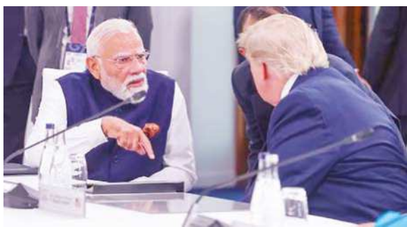
US President Donald Trump with PM Narendra Modi on the sidelines of the G7 summit in Evian-les-Bains, France, on Wednesday

"Lakhs of Indian seafarers operate in maritime sector; I believe that their security is equally important," PM Modi told President Trump. India lost 3 Indian seafarers in an