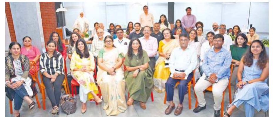
Women led startups at India's first SHElterTech Accelerator organised by We Hub

Dates: 19th and 20th June 2026. Venue: MSU Store, Jubilee Hills, Hyderabad.