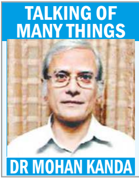
TALKING OF MANY THINGS

IN the Vedas 'vrata' or 'nomu's are religious rituals, vows, or observances aimed at fulfilling a desire, seeking blessings, ensuring family welfare, to attain specific goals such as health, wealth, prosperity or overcoming adversity. They involve specific, ritualized restrictions, such as avoiding certain foods on specific days, strict adherence to certain customs and vows, or a 'sankalpam', to gain spiritual merit. They primarily serve to align the individual with cosmic order, purify the mind and body, and foster discipline through voluntary sacrifice. They also represent a divine ordinance acting as a binding commitment to ethical conduct and spiritual focus, often involving fasting or specific ascetic practices to propitiate deities.