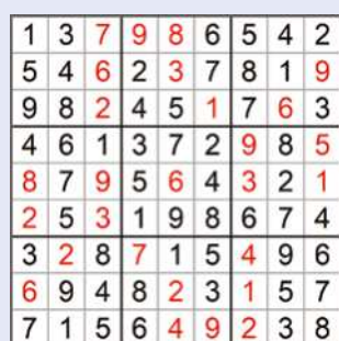
Solution to June 17