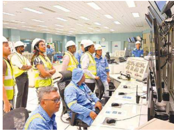
Members of AP municipal administration and urban development department delegation at Tuas South Incineration Plant in Singapore on Wednesday

At NUS Cities, officials explored opportunities for collaboration in urban planning, climate resilience, gov-