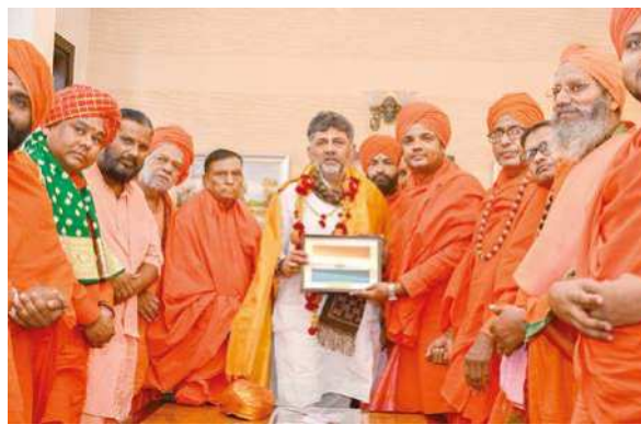
the seer had raised concerns regarding alleged injustice meted out to the Ediga and other backward commu-