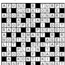
Solution to June 17