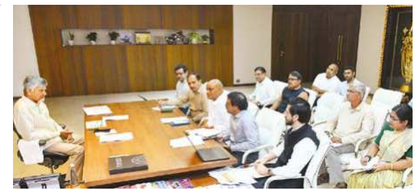
Chief Minister N Chandrababu Naidu reviews agriculture, horticulture and aquaculture sectors at the Secretariat in Amaravati on Wednesday

negotiator... You look at this man. I'll give you a lesson. He's the most beautiful-looking man. He looks so nice, like an angel. But actually, he's as tough as a killer... But he looks so good. So he gets you by surprise. There are a few people like this," Trump said as the two leaders held a bilateral meeting in France. Continued on Page 7