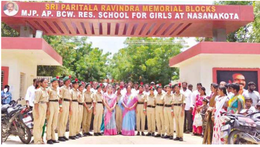
Students and staff gather at the MJP AP BC Welfare Residential School for Girls in Nasanakota