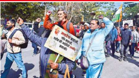
According to an analysis by the activists, no major state would be able to generate even half of the promised 125 days of employment per active job card in the proposed interim allocations

They further alleged that the proposed framework centralises powers with the Centre while reducing