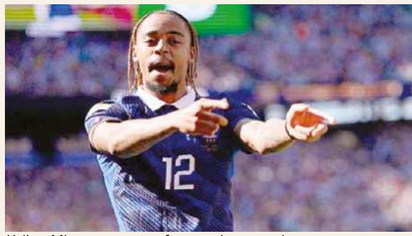
Kylian Mbappe reacts after scoring a goal