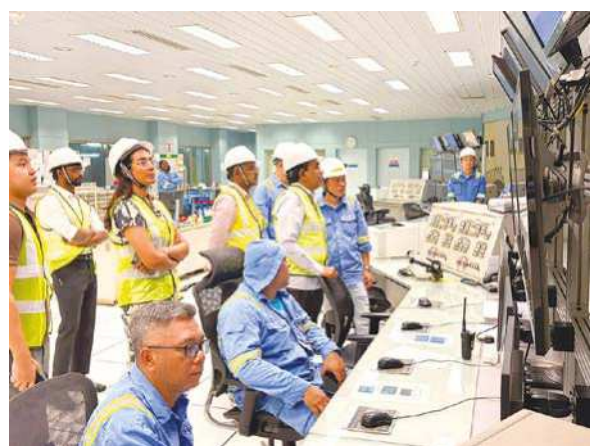
Members of AP municipal administration and urban development department delegation at Tuas South Incineration Plant in Singapore on Wednesday

At NUS Cities, officials explored opportunities for collaboration in urban planning, climate resilience, gov-