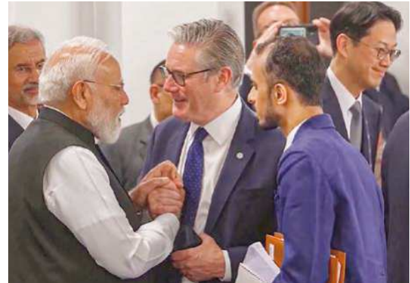
Prime Minister Narendra Modi interacts with Britain's Prime Minister Keir Starmer during a working session at the G7 Summit, in Evian-les-Bains, France

"Like the vision of IMEC, can we work on connectivity projects with countries in Africa, Latin America and the Pacific Islands?" Modi asked while speaking at the session on "Reviving a Balanced, Shared and Sustainable Economic Growth for