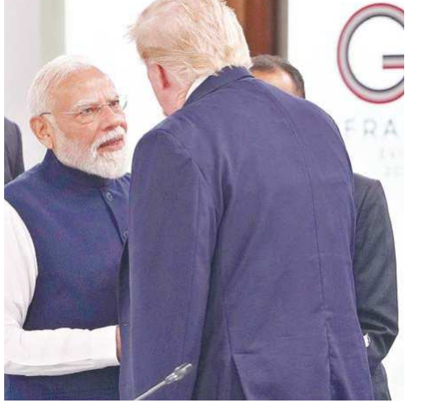
PM Narendra Modi shakes hands with US President Donald Trump before the plenary session of the G7 summit in Evian-les-Bains, France, on Tuesday

NEW DELHI A scheduled meeting between Prime Minister Narendra Modi and United States President Donald Trump on the sidelines of the G7 Summit in France is set to be one of the most closely watched diplomatic engagements of the week, as world leaders converge in the lakeside resort town of Evian amid growing geopolitical tensions, economic uncertainty, and mounting security challenges. Modi arrived in France to participate in the 52nd G7 Summit, where discussions are expected to range from the war in Ukraine and the evolving situation in West Asia to global trade, energy security, and the future of international governance. His anticipated talks with Trump are likely to focus on bilateral trade, tariff issues, the global oil market, regional conflicts, and broader geopolitical developments that are reshaping international relations. Continued on Page 5