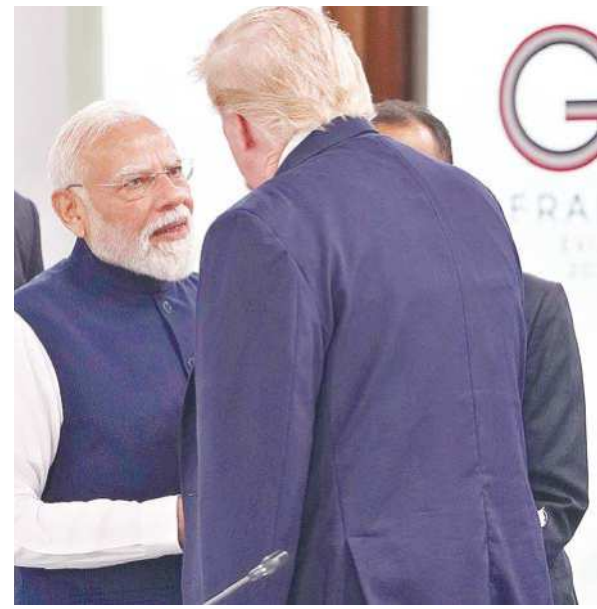
PM Narendra Modi shakes hands with US President Donald Trump before the plenary session of the G7 summit in Evian-les-Bains, France, on Tuesday