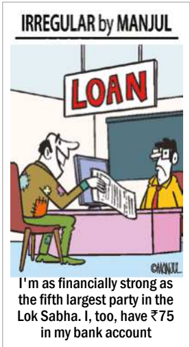
I'm as financially strong as the fifth largest party in the Lok Sabha. I, too, have ₹75 in my bank account