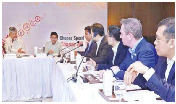
Chief Minister N Chandrababu Naidu at the Semicon Ecosystem Roundtable Conference in Singapore on Tuesday

He stated that India has emerged as one of the world's most attractive investment destinations and that Andhra Pradesh offers