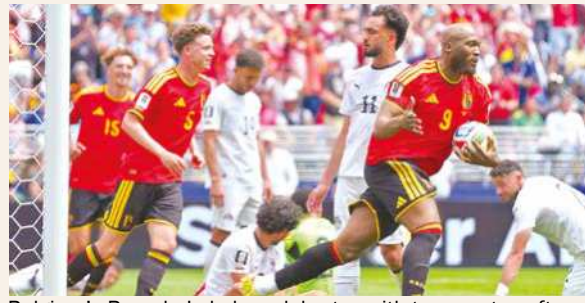
Belgium's Romelu Lukaku celebrates with teammates after a self goal from Egypt earn a draw for the latter