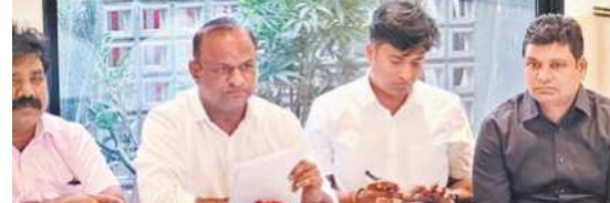
HANS NEWS SERVICE HYDERABAD

THE Telangana Cricket Association (TCA) has announced that it will issue legal notices to several film personalities, cricketers and Hyderabad Cricket Association (HCA) officials over their alleged association with the proposed