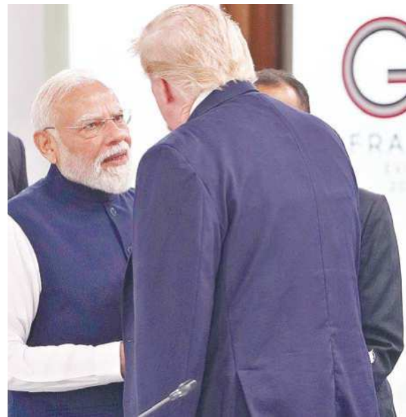
PM Narendra Modi shakes hands with US President Donald Trump before the plenary session of the G7 summit in Evian-les-Bains, France, on Tuesday