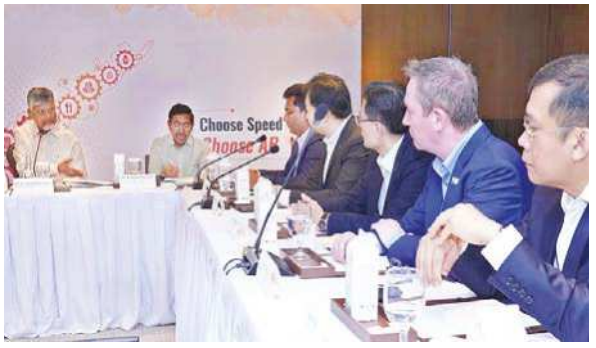
Chief Minister N Chandrababu Naidu at the Semicon Ecosystem Roundtable Conference in Singapore on Tuesday

He stated that India has emerged as one of the world's most attractive investment destinations and that Andhra Pradesh offers