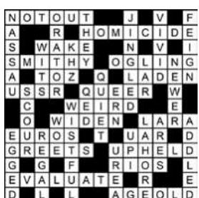
Solution to June 16