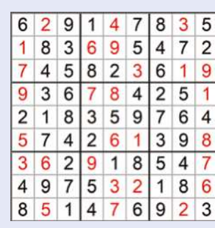
Solution to June 16