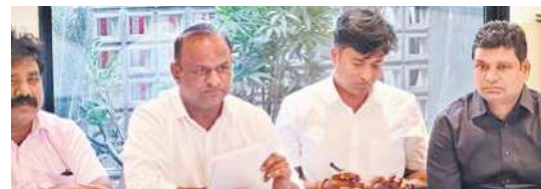
HANS NEWS SERVICE HYDERABAD

THE Telangana Cricket Association (TCA) has announced that it will issue legal notices to several film personalities, cricketers and Hyderabad Cricket Association (HCA) officials over their alleged association with the proposed