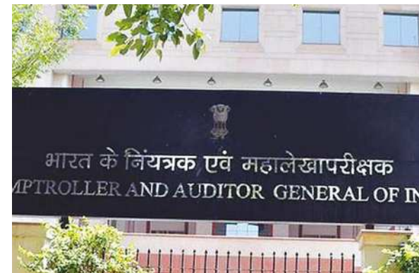
COMPTROLLER AND AUDITOR GENERAL OF INDIA

cit parameters shows that states as a whole, during the period 2015-16 to 2024-25, remained in revenue and fiscal deficit. A substantial increase in revenue deficit took place in 2020-21, a year impacted by the Covid pandemic.