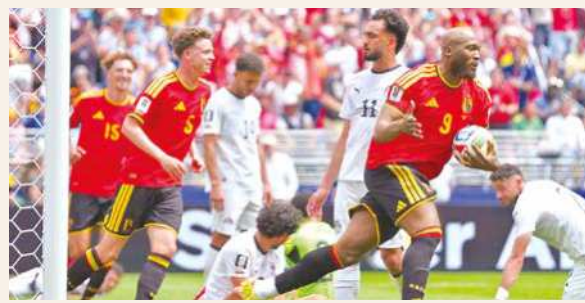
Belgium's Romelu Lukaku celebrates with teammates after a self goal from Egypt earn a draw for the latter