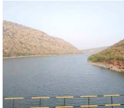
Gandikota reservoir in YSR Kadapa district