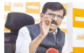
Rajya Sabha member said.

Talking to reporters in New Delhi, Raut targeted the ruling BJP, accusing it of splitting parties and saying this was bad for the country's political health. "All Shiv Sena (UBT) MPs are together and will remain together," the