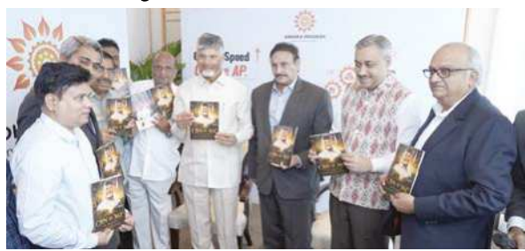
Chief Minister N Chandrababu Naidu along with others releases 'CBN@361 Degrees-Polymath' in Singapore on Tuesday