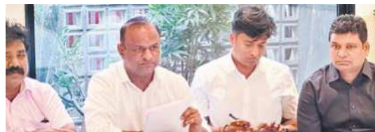
HANS NEWS SERVICE HYDERABAD

THE Telangana Cricket Association (TCA) has announced that it will issue legal notices to several film personalities, cricketers and Hyderabad Cricket Association (HCA) officials over their alleged association with the proposed