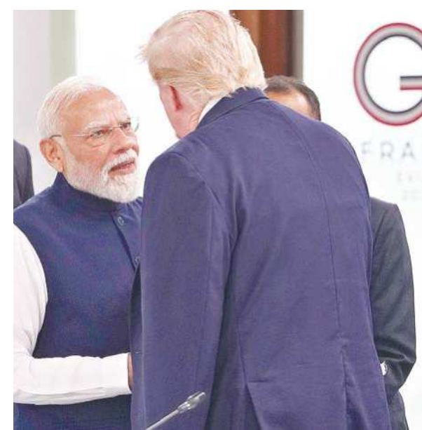
PM Narendra Modi shakes hands with US President Donald Trump before the plenary session of the G7 summit in Evian-les-Bains, France, on Tuesday

NEW DELHI A scheduled meeting between Prime Minister Narendra Modi and United States President Donald Trump on the sidelines of the G7 Summit in France is set to be one of the most closely watched diplomatic engagements of the week, as world leaders converge in the lakeside resort town of Evian amid growing geopolitical tensions, economic uncertainty, and mounting security challenges. Modi arrived in France to participate in the 52nd G7 Summit, where discussions are expected to range from the war in Ukraine and the evolving situation in West Asia to global trade, energy security, and the future of international governance. His anticipated talks with Trump are likely to focus on bilateral trade, tariff issues, the global oil market, regional conflicts, and broader geopolitical developments that are reshaping international relations. Continued on Page 5