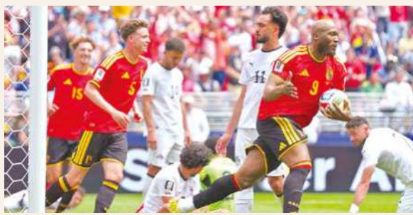
Belgium's Romelu Lukaku celebrates with teammates after a self goal from Egypt earn a draw for the latter