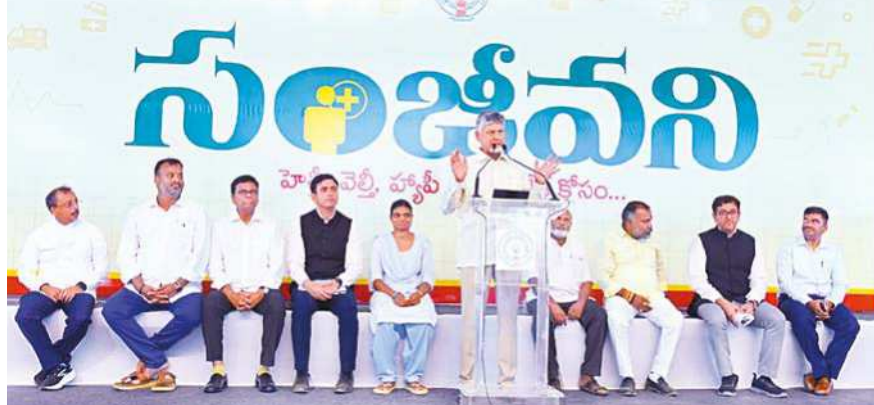
Chief Minister N Chandrababu Naidu addressing a public meeting in Yadamarri village in Chittoor district after the launch of Sanjeevani project on Saturday