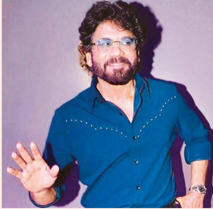
romantic classics like Geethanjali and entertainers including Manmadhuru, Hello Brother, and

Fondly referred to as Tollywood's "Celluloid Scientist," Nagarjuna has constantly reinvented himself across generations. From intense performances in Siva to