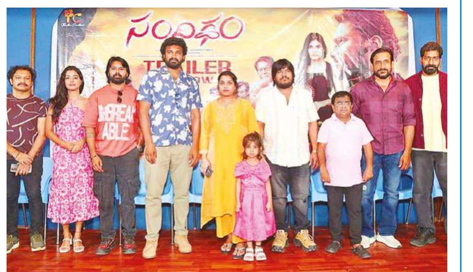
journey. Technically, Sandigdham features cinematography by