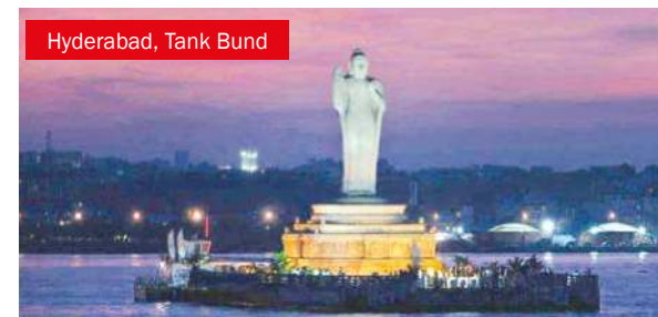
Hyderabad, Tank Bund

Looking more closely at transport, the Chennai Metro covers 54.1 km. It has two main lines, Blue and Green, and 41 stations. These connect the city to its suburbs, including