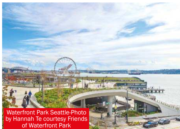
Waterfront Park Seattle-Photo by Hannah Te courtesy Friends of Waterfront Park