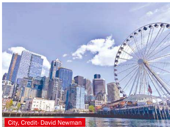
City