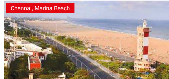
Chennai, Marina Beach

While Chennai still leads in research output,