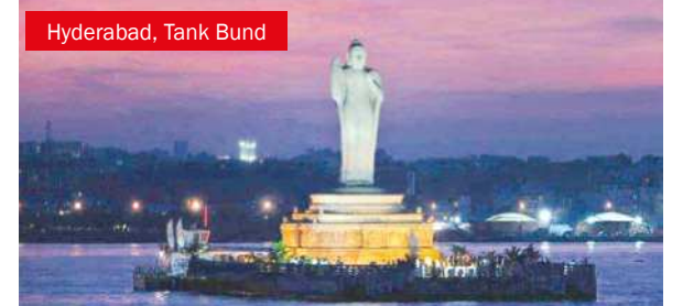
Hyderabad, Tank Bund

Looking more closely at transport, the Chennai Metro covers 54.1 km. It has two main lines, Blue and Green, and 41 stations. These connect the city to its suburbs, including