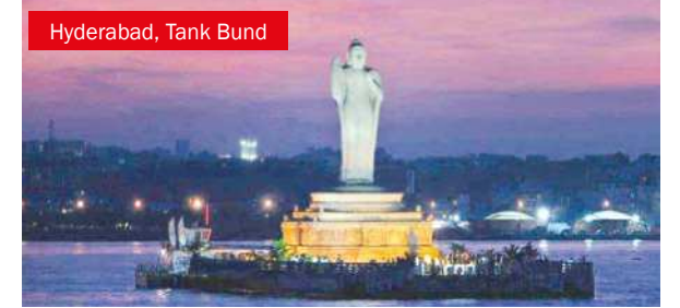
Hyderabad, Tank Bund

Looking more closely at transport, the Chennai Metro covers 54.1 km. It has two main lines, Blue and Green, and 41 stations. These connect the city to its suburbs, including