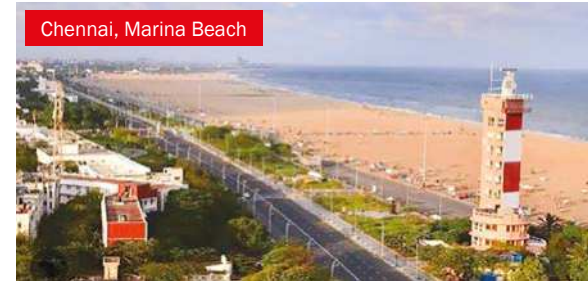
Chennai, Marina Beach

While Chennai still leads in research output,