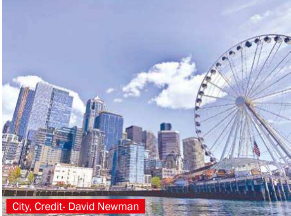
City