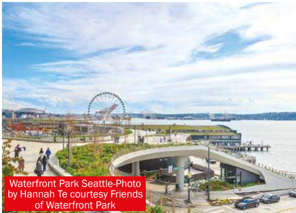
Waterfront Park Seattle