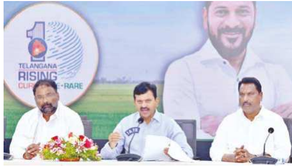
Information & Public Relations Minister Ponguleti Srinivas Raddy briefing the media after the Cabinet meeting at the Secretariat in Hyderabad on Saturday