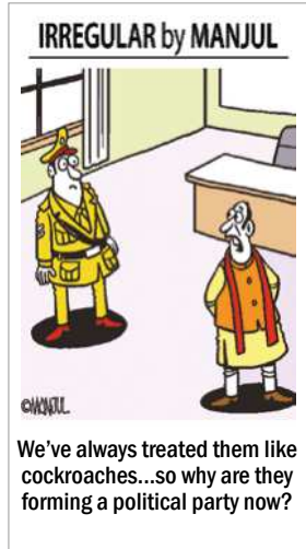
We've always treated them like cockroaches...so why are they forming a political party now?

language (R3) in Class tenth and that all assessments for R3 will be entirely school-based and internal. Further, the board said, the performance of students in R3 will be duly reflected in the CBSE certificate. No student will be barred from appearing in the Class tenth Board Examinations due to R3, it added. Students themselves admit that language choice is often strategic. "I am a child of a Telugu-speaking couple who grew up in Hyderabad; so, Hindi was chosen as my second language, and Tamil became my inevitable third," shared one student. Continued on Page 4