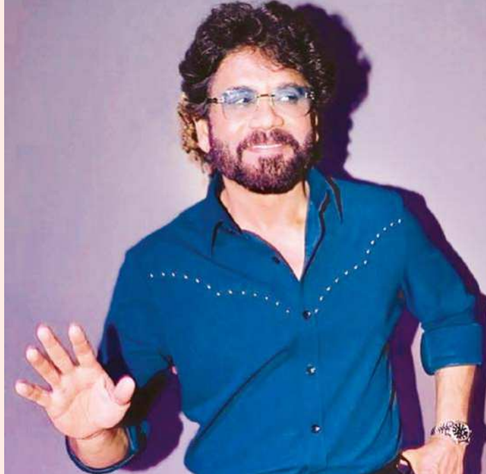
romantic classics like Geethanjali and entertainers including Manmadhuru, Hello Brother, and

Fondly referred to as Tollywood's "Celluloid Scientist," Nagarjuna has constantly reinvented himself across generations. From intense performances in Siva to