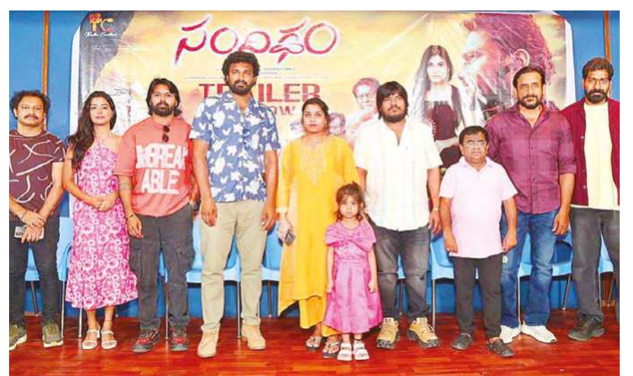
journey. Technically, Sandigdham features cinematography by