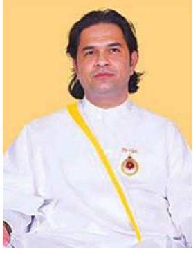
RAJYOGI BRAHMA KUMAR NIKUNJ JI

In the present world many people consider survival and security as prime values. They argue that if a person does not survive, then what value the other values have for him. In a similar vein, they further argue that if a person lives in a state of constant insecurity and fear, then what is the charm, the joy, the fun or the zest in living? Because the quality of life of a man in fear is like that of a man in a state of suspended animation and it's not at all cherishable, relishable, enjoyable or valuable. On the other hand, there are other people who question the contention of the former kind of people. The questions they raise are that 'after all what is the purpose of survival?' & 'what is the goal of life?'. Further they ask 'what do we want to achieve by living or while living?'. They argue