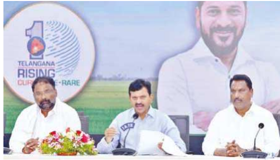
Information & Public Relations Minister Ponguleti Srinivas Raddy briefing the media after the Cabinet meeting at the Secretariat in Hyderabad on Saturday

THE state government has announced a massive housing scheme of constructing one lakh new houses for the poor and middle classes in the Core Urban Region Economy (CURE) areas of the three municipal corporations viz. Greater Hyderabad, Malkajigiri and Cyberabad this year.