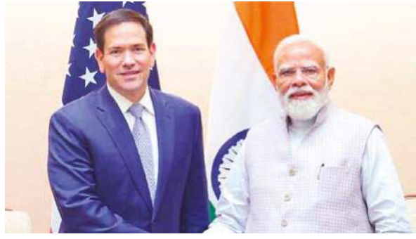
Prime Minister Narendra Modi with US Secretary of State Marco Rubio in New Delhi on Saturday