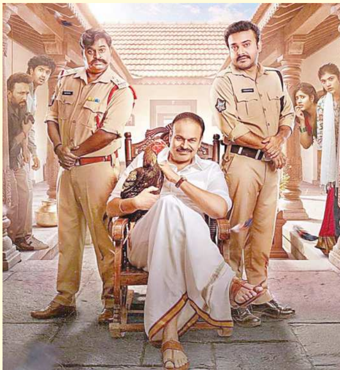
Dance in key roles.