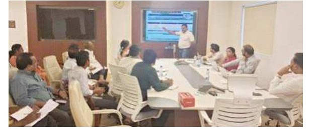
C-DAC officials from New Delhi participate in the high-level review meeting at APSMIDC headquarters in Mangalagiri Friday.

At present, medicine procurement and supply to government hospitals in Andhra Pradesh are being managed through the e-Aushadhi application. The government spends nearly Rs 800 crore annually on medicines and