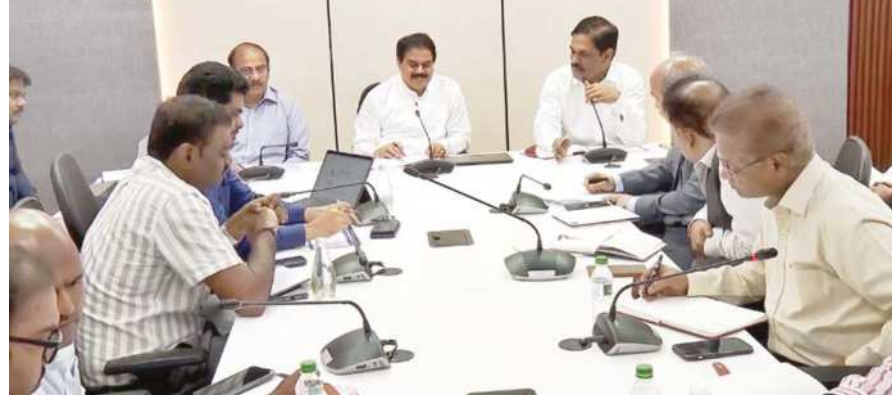
Civil supplies minister Nadendla Manohar holds a review with officials and representatives PNG companies at the Secretariat in Amaravati on Friday

The minister assured that the government is granting approvals for gas expansion works in cities and towns at a faster pace and promised immediate resolution of any issues faced by companies. He also said the government would facilitate land allotment on lease basis for setting up PNG filling stations. Highlighting the need