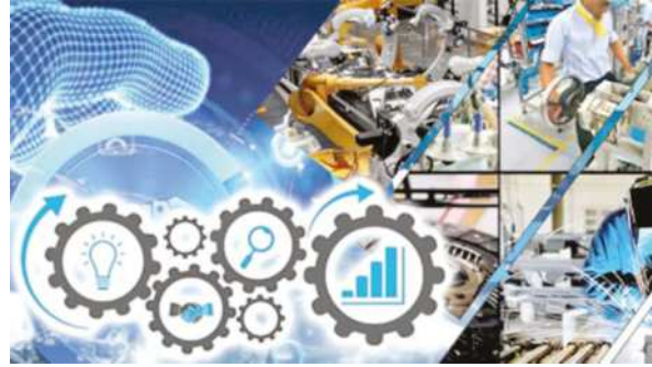
Picture for representational purpose only

Explaining the framework of ECLGS 5.0, the minister said MSMEs would receive 100 per cent credit guarantee coverage in the event of loan default, while non-MSME sectors would be eligible for guarantee protection of up to