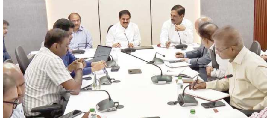
Civil supplies minister Nadendla Manohar holds a review with officials and representatives PNG companies at the Secretariat in Amaravati on Friday

The minister assured that the government is granting approvals for gas expansion works in cities and towns at a faster pace and promised immediate resolution of any issues faced by companies. He also said the government would facilitate land allotment on lease basis for setting up PNG filling stations. Highlighting the need