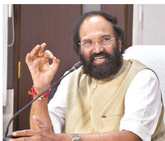
The minister accused the previous BRS government of corruption and irregularities at procurement centres.

In a sharply worded statement, Uttam Kumar Reddy alleged that BRS leaders were spreading misinformation to create confusion among farmers. He asserted that the Congress government was conducting grain procurement under the "Praja Palana"