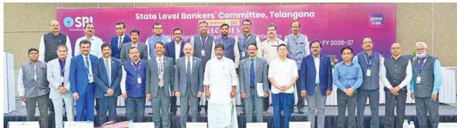
Deputy Chief Minister Mallu Bhatti Vikramarka at the 49th State Level Bankers' Committee meeting in Hyderabad on Friday