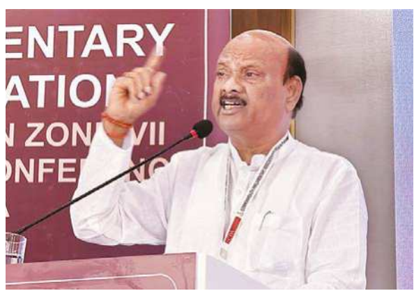
Assembly Speaker Ch Ayyanna Patrudu addressing

He stressed that for youth to contribute meaningfully they must first enter politics and succeed in legislative roles. However, prevailing political practices, including disruptions in legislatures and lack of decorum, discourage young aspirants. He called for exemplary conduct