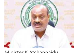
Minister K Atchanna speaking to media at the Secretariat on Thursday

made at the time, and later political developments involving individuals linked to the same corporate group. In a further escalation, the TDP leader drew parallels with the murder of Y S Vivekananda Reddy, suggesting a pattern of political ambition overriding relationships, remarks that added fuel to the already intense political confrontation. Reacting strongly, YSRCP senior leader and Leader of Opposition in Legislative Council Botcha Satyanarayana lashed out at Chief Minister N Chandrababu Naidu and the TDP, accusing them of resorting to "cheap and disgraceful politics" for political mileage. Satyanarayana turned emotional while recalling YSR, visibly moved as he condemned the remarks. "Is this the level of politics? Don't they feel ashamed?" he said, alleging that the ruling party was deliberately making provocative statements to divert attention from the positive discussions around the MAVIGUN (Machilipatnam-Vijayawada-Guntur) proposal put forward by Jagan Mohan Reddy.