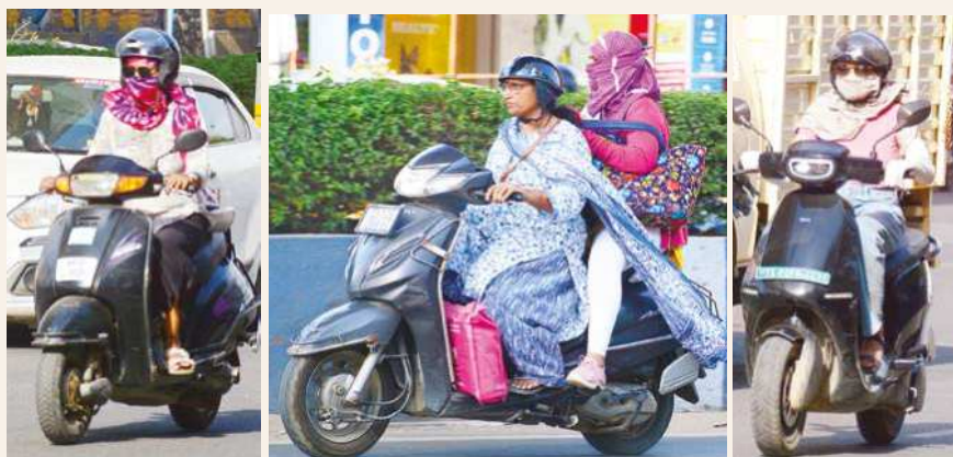
Bike riders shield themselves from hot sun by wrapping up their head with scarves in Hyderabad on Thursday