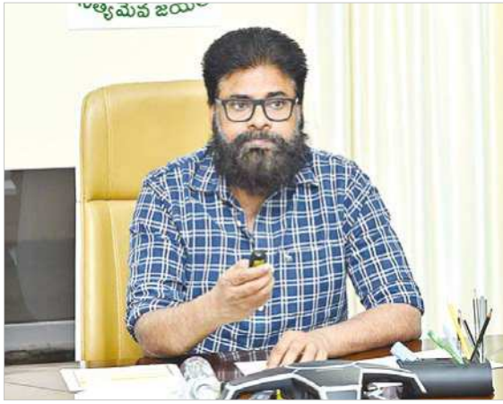
Dy CM Pawan Kalyan

"TRUE development is achieved not merely through construction activities but by improving basic infrastructure and bringing meaningful change in people's lives", Deputy Chief Minister Konidela Pawan Kalyan said on Thursday. He stressed the need to instil confidence and provide security for the future of citizens. He was speaking while virtually inaugurating and laying foundation stones for several development works in the Razole constituency. A major drinking water project constructed at a cost of Rs 17.33 crore at Antarvedi was inaugurated on the occasion. He also laid the foundation stone for rapid sand filter units with a capacity of 6 million litres, being taken up with Rs 5 crore from ONGC funds.